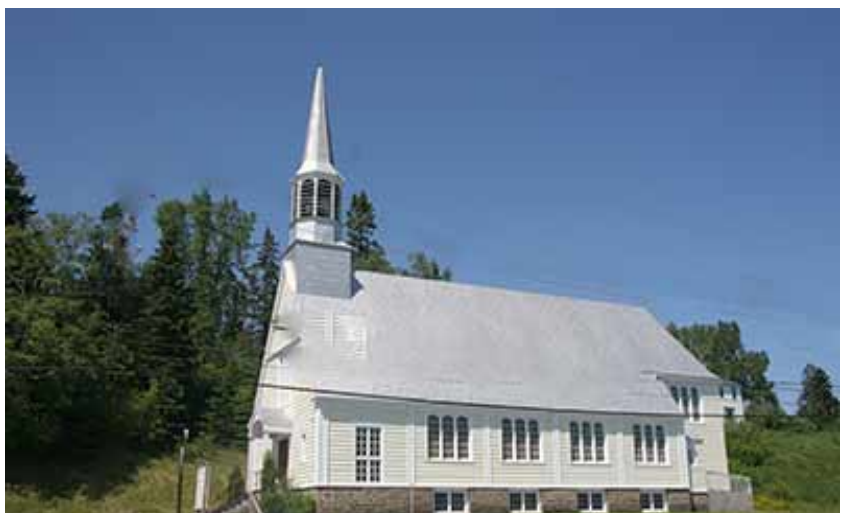
St Paul's Church, Gaspé