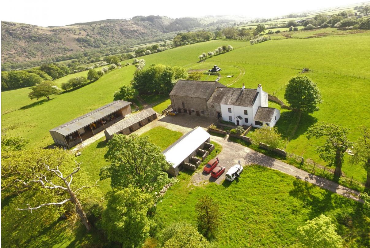
Kitchen Ground, Irton, Cumberland, UK – seemingly ancestral home of the Kitchen family